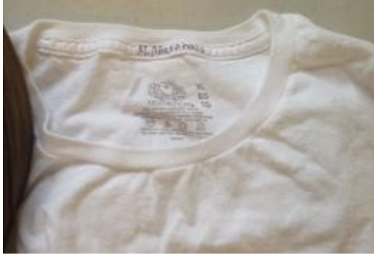
On the tag of the t-shirt or small on the collar.