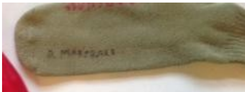
On the top side of the sock near the toe.