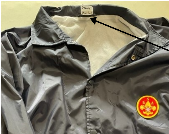
On the White Tag inside the top of the Jacket.